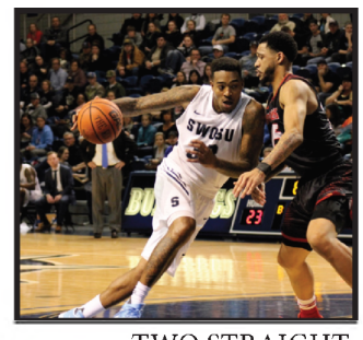
TWO STRAIGHT --page 5