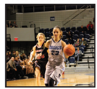
BIG WIN AT HOME --page 5