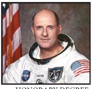
HONORARY DEGREE --page 4