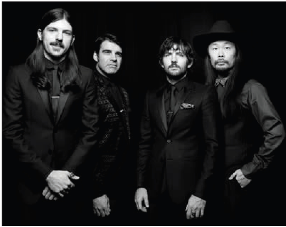
The Avett Brothers