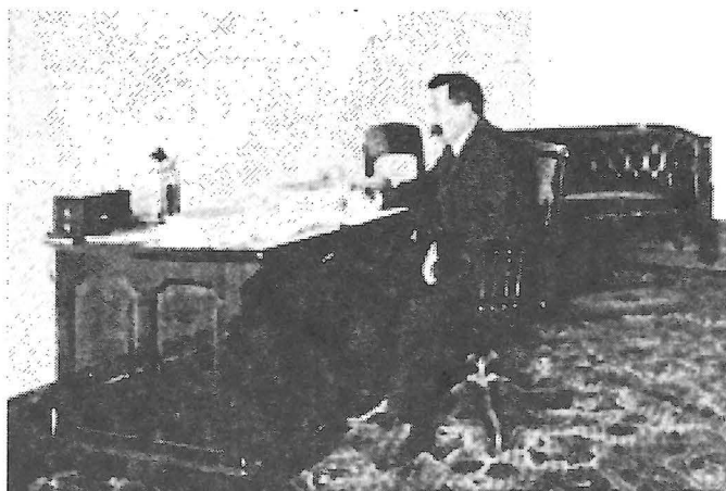
President's Office (SWN Catalogue, 1904-05)