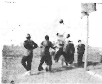
Outdoor basketball court, (1911 Oracle, SWN Yearbook)