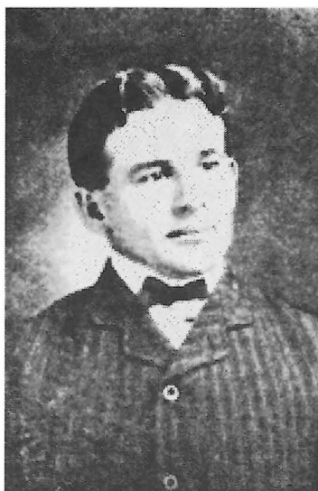
(1906 Oracle, SWN Yearbook)

Custer County Republican October 8, 1903