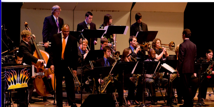
40th Annual SWOSU Jazz Festival