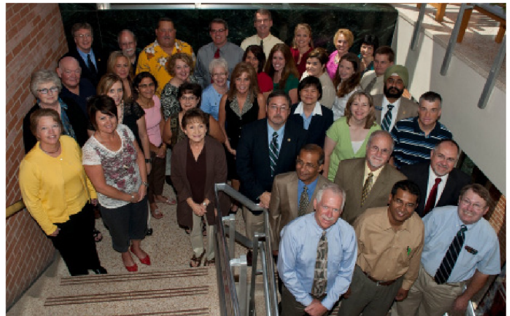
2011-2012 SWOSU College of Pharmacy Faculty, Staff and Administration

The SWOSU College of Pharmacy Administration, Faculty and Staff individual profiles can be found on the SWOSU COP website ( www.swosu.edu/academics/pharmacy ).