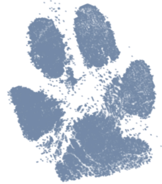
SWOSU Men's Golf Team