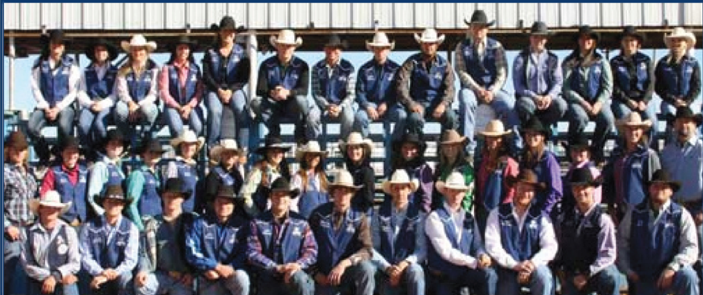
SWOSU Women's & Men's Rodeo Team