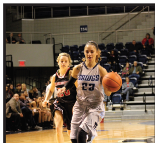
BIG WIN AT HOME --page 5