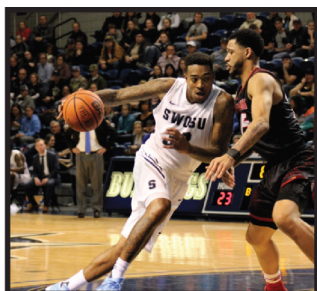
TWO STRAIGHT --page 5