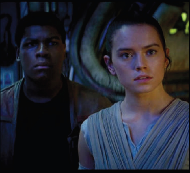
Episode VII has eclipsed $1.8 billion worldwide.