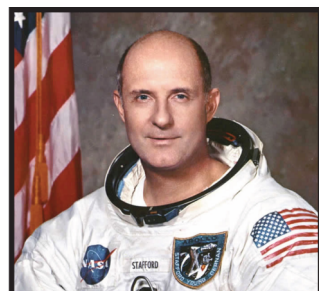
HONORARY DEGREE --page 4