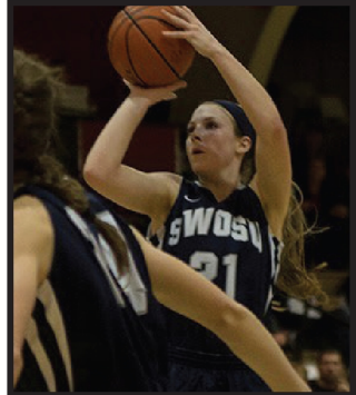
TOUGH LOSS --page 5