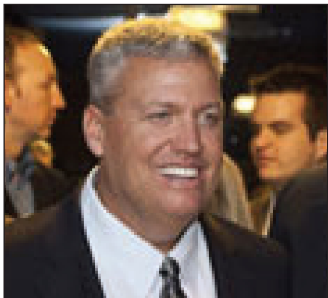
Rex Ryan speaks at his induction into the Southwestern Athletic Hall of Fame in 2012. Ryan was recently selected as the new head coach of NFL's Buffalo Bills.