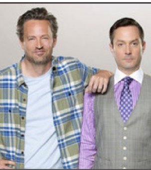
The Odd Couple