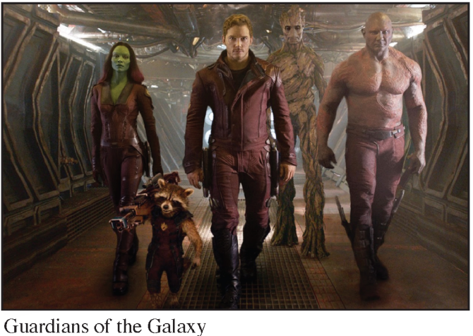
Guardians of the Galaxy