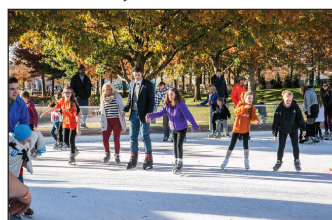
Devon Ice Rink in downtown Oklahoma City carriage, live music entertainment, and plenty of lights to look at along with Oklahoma's tallest outdoor Christmas tree. There are many more activities going on that are sure to appeal to almost anyone. You can find all these and more at travelok.com.

to educate children of all different cultures. With winter approaching, Devon Energy will again set up the Devon Ice Rink. The rink will open Nov. 15, and will close Jan. 4, 2015, for anyone to come ice skate in downtown OKC. On Nov. 25, Chesapeake will put up its holiday light display to light up downtown OKC with over 4.3 million LED lights. The R.K. Gun show is coming to the OKC fairgrounds. The gun show will start Nov. 22 and end Nov 23. Then on Nov. 29-30, the gun, knife, and outdoor equipment show will also be at the fairgrounds. In Tulsa on Nov. 21-23, An Affair of the Heart, one of the largest arts and craft shows in the United States, will be held at the Expo Square. On Nov. 22, the Williams Route 66 marathon and half marathon will be held in downtown Tulsa. Starting on Nov. 28, Winterfest will begin in Tulsa. Downtown Tulsa is transformed into a festive wonderland during Winterfest, an annual holiday tradition. There will be outdoor ice skating, rides in a horse-drawn