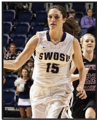
PLAYOFFS START --page 5