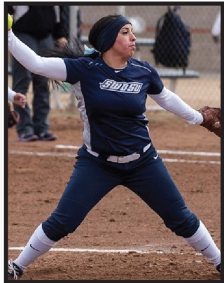
NO-HITTER --page 5