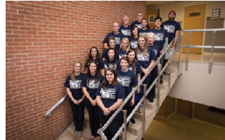
TRIP TO PANAMA --page 3