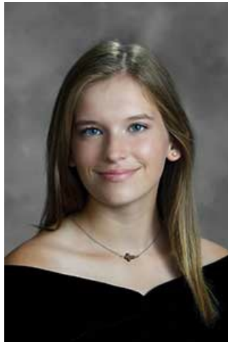
Alexa Benedict Burns Flat – Dill City