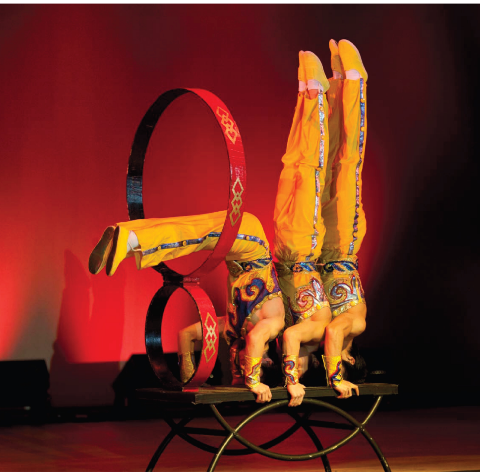
The Peking Acrobats perform several incredible feats during their Panorama performance last Thursday. The performance was delayed due to a snow storm.