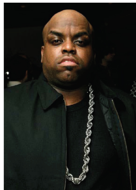
Clockwise: Popular musicians like Bruno Mars, Katy Perry, Cee-Lo Green and Lady Gaga are all multiple nominees at this years Grammy Awards.

State of Mind' by Jay-Z and Alicia Keys wins Record of the Year, Mumford and Sons wins Best New Artist, and Contra by Vampire Weekend wins Best Alternative Album.