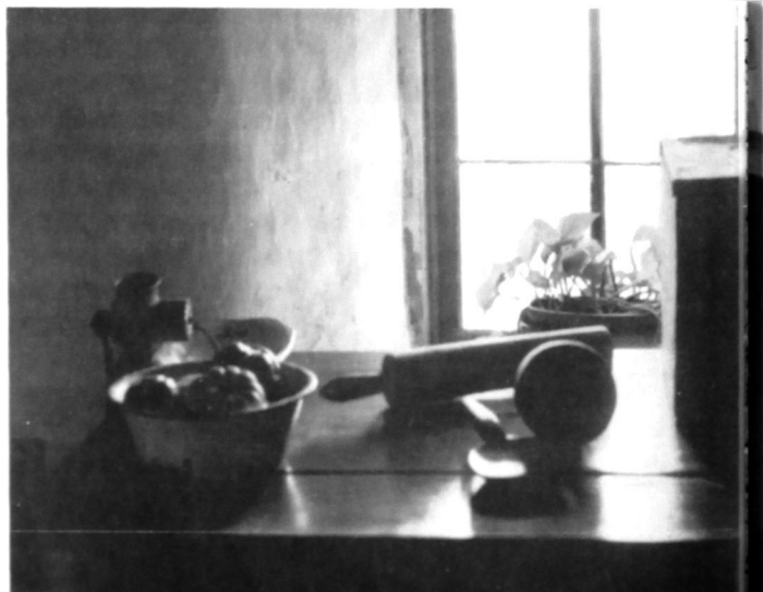
Interior of a sod house near Homestead, which is registered with the National Historical Society.