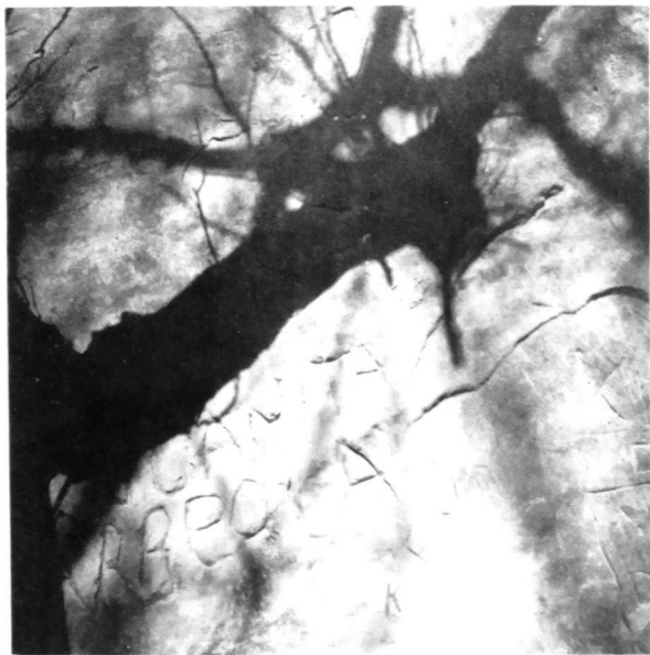
Shadow and texture from Red Rock State Park located at Hinton.