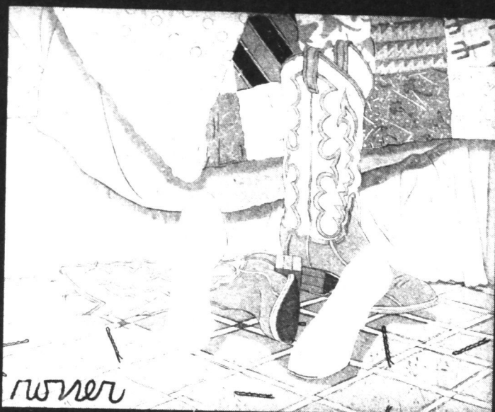
"When Cowboy Company Comes"