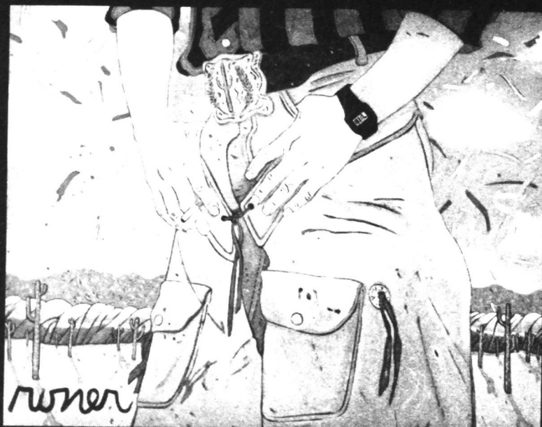
"A Cowboy's Better Half"