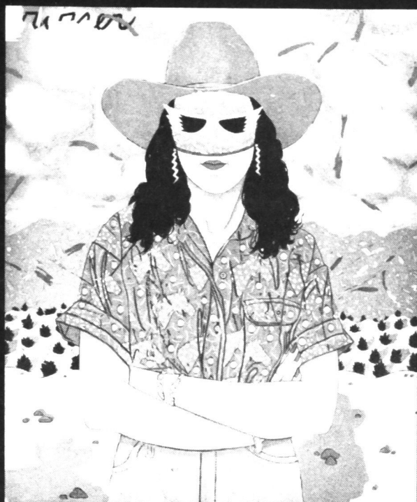
"Shades of the West"