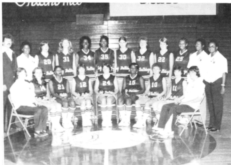
81 - 82 Lady Bulldogs