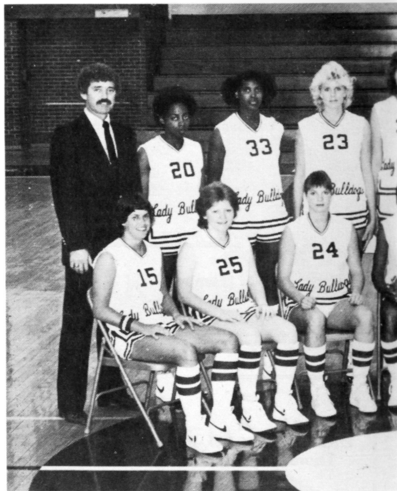
83 - 84 Lady Bulldogs.

Juniors on the winning team aided the underclassmen in