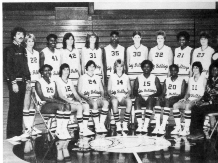
82 - 83 Lady Bulldogs.